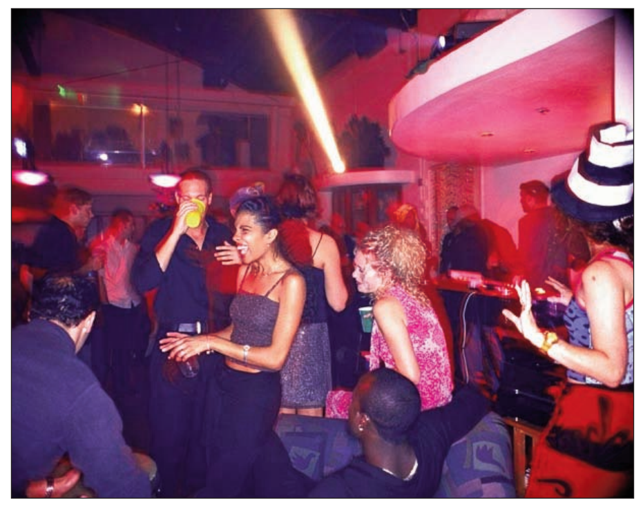
To protect yourself against a rapist using drugs: