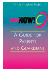
Parent & Guardian Guide