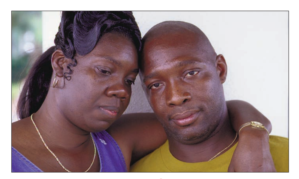
FROM THE START ...

Sexual violence can traumatize not only the victim, but also their family and friends. Family and friends often do not know how to help. Each person's reaction to being assaulted is individual. Each person's pain and needs will be theirs alone. This pamphlet provides guidance for those whose family member or friend has been sexually assaulted.